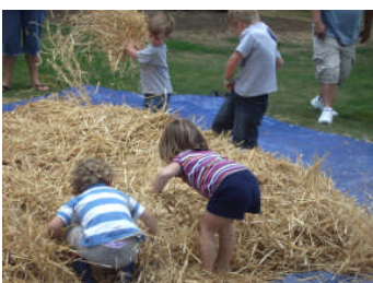
Kids looking for that St. John's picnic?

This was printed on hand bills the next day and distributed through Baltimore. Interestingly, although the American navy and army had recognised the Star Spangled Banner as the National Anthem of the United States for some time, it was not until 1931 that it was officially recognised by Congress. You will see the stars and stripes flying from Gloucester Cathedral to this day because of this connection.